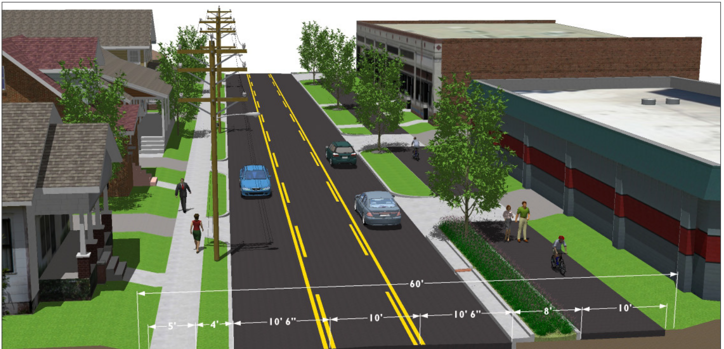
Looking east along Hudson St. The rendering shows a cross section of the proposed streetscape along Hudson St. Note the new 10-foot shared-use path to the south of Hudson St. and the new 5-foot sidewalk to the north.